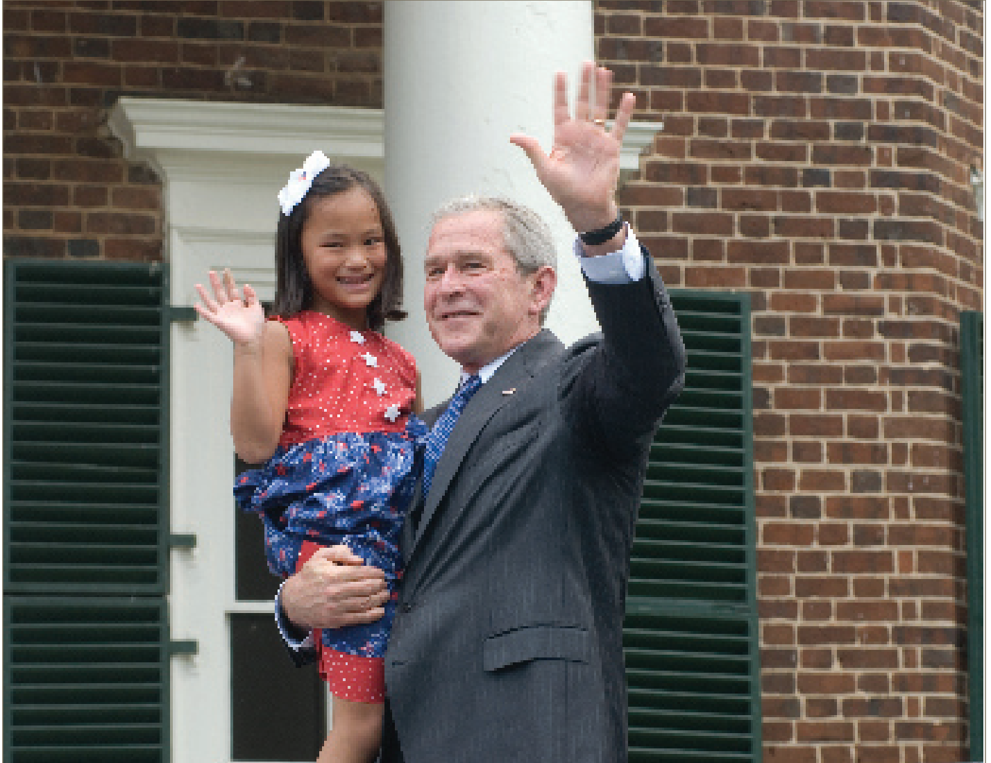
George W. Bush, President of the United States, 2008